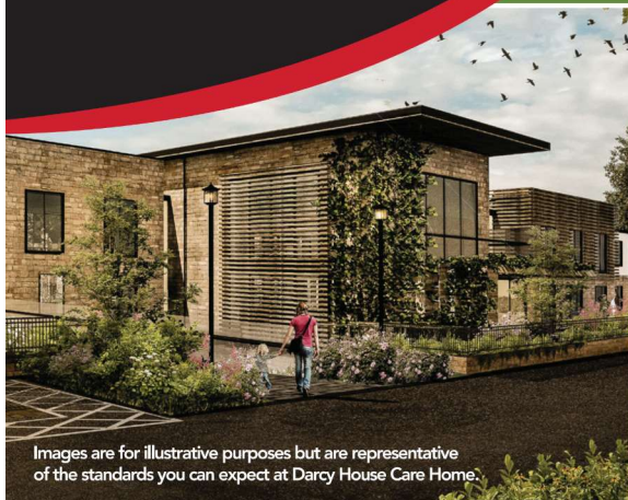
Images are for illustrative purposes but are representative of the standards you can expect at Darcy House Care Home.